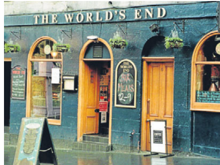
The World's End in Edinburgh.